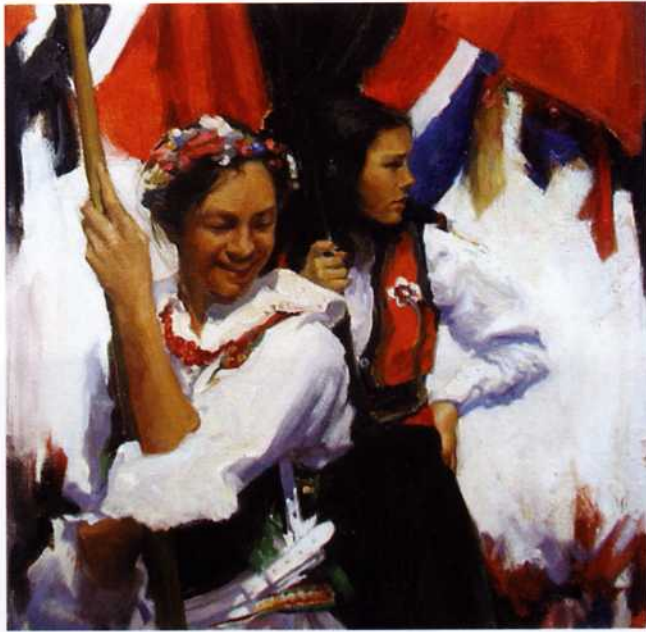
MAY FESTIVAL NORWAY, OIL ON CANVAS, 20 X 20"

Her time now is divided between teaching and painting, spending her summers abroad painting the French countryside, and her winters in West Texas painting the mountains and desert. "There is no substitute for painting directly from life", she says. "Magical things can happen when we are in direct