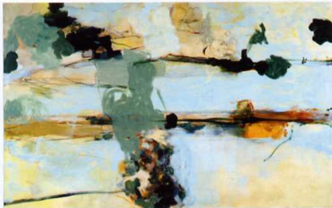
AIRBORNE, OIL ON CANVAS, 40 1 / 2 X 64 1 / 2 X 2"

Terrell James's paintings, works on paper and fine art prints explore her abiding interest in nature and organic forms, eliciting a likeness to landscapes without being depictive or illustrative. Not only are her works compelling because of the artistic gestures they chronicle, but because of the visual language that James projects. She has mastered a lyric freedom usually seen in watercolor, rather than in oil. One feels the presence of the unconscious, of the present moment, and also of history—art history, personal history, one's history of looking, in general, and at these pictures in particular. What her paintings mean, and what each canvas tells us, are—thanks to the eloquence of her brush—the conclusion of our own journey through light and color. A true master of her craft, James' work has been widely exhibited and is included in the Dallas Museum of Art, Museum of Fine Arts in Houston, and The Portland Art Museum in Oregon, as well as the corporate and private art collections throughout the nation. She currently serves as Head of the Painting Department at the Glassell School of Art of the Museum of Fine Arts, Houston. ●